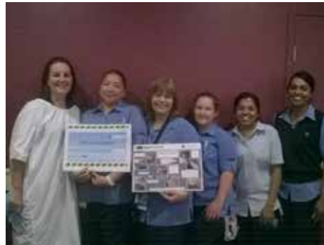
Campbelltown Private Poster competition