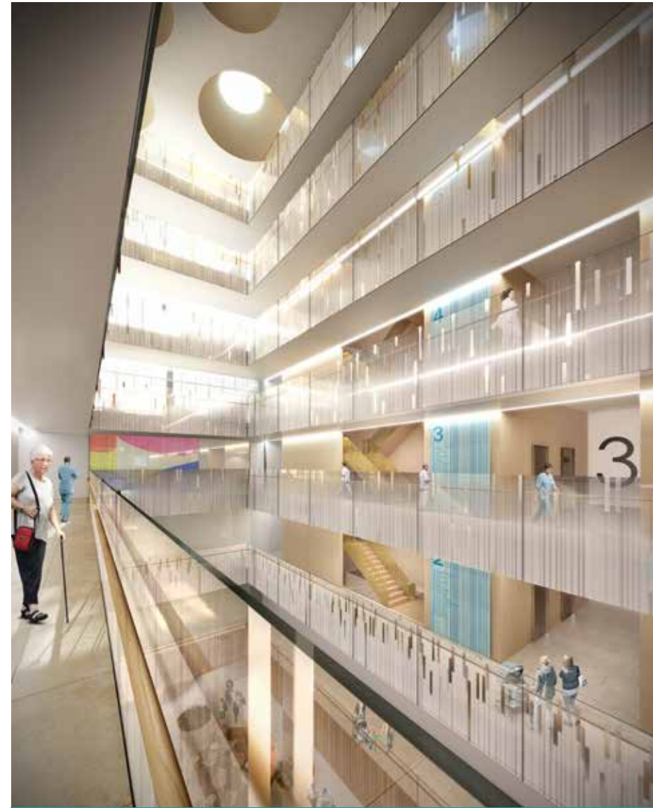
Architectural drawing of upper levels of the atrium