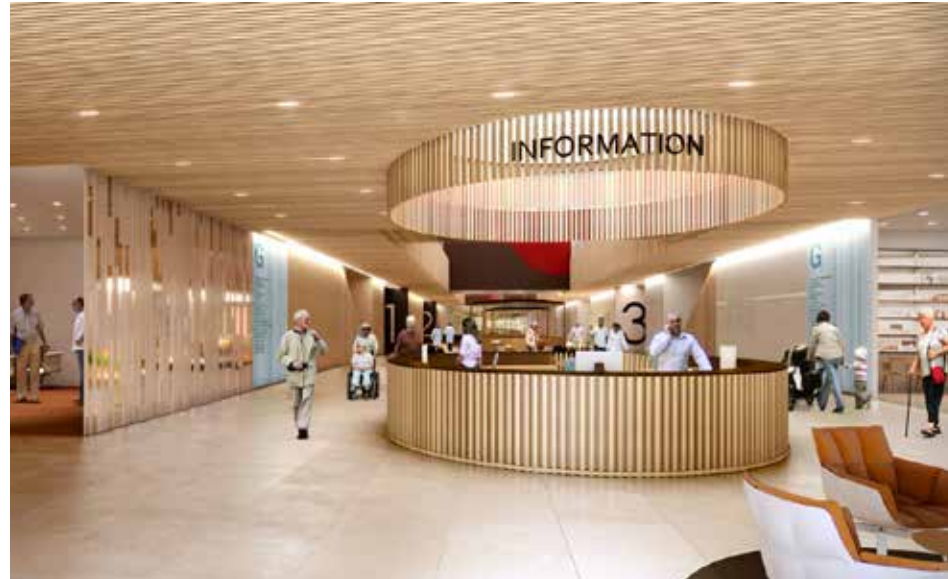
Artist impression of reception area

While the Northern Beaches has one of Australia’s highest rates of private health insurance, residents