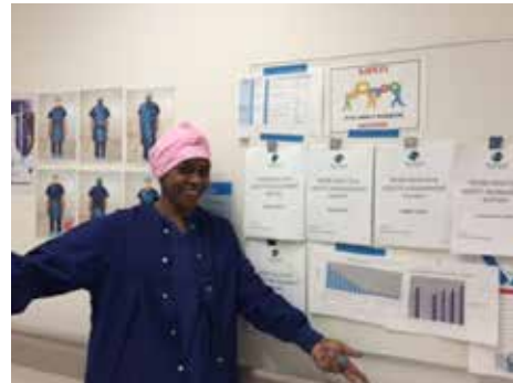
Norwest Private Theatres Safety Notice Board competition

The following table outlines the activities that were undertaken across the business division.