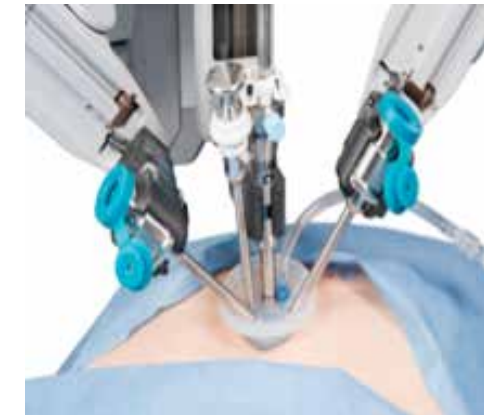
Example of da Vinci Single-Site Robotic Surgery Device

KPH has now successfully undertaken 11 surgical assisted robotic procedures over a two month period. These procedures have occurred in the specialties of Urology and Gynaecology.