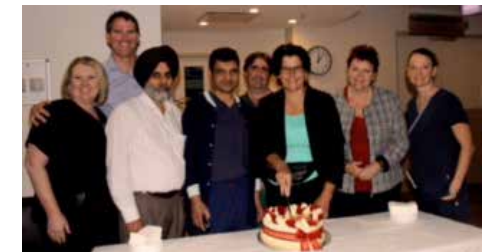
Newcastle Private Hospital celebrates the completion of its 50th heart procedure.

This new service is a welcome addition to the already diverse and comprehensive range of services provided at Newcastle Private Hospital and the introduction of these procedures sees the hospital expanding its care for patients not only from the Newcastle and Hunter district but also from regional areas.