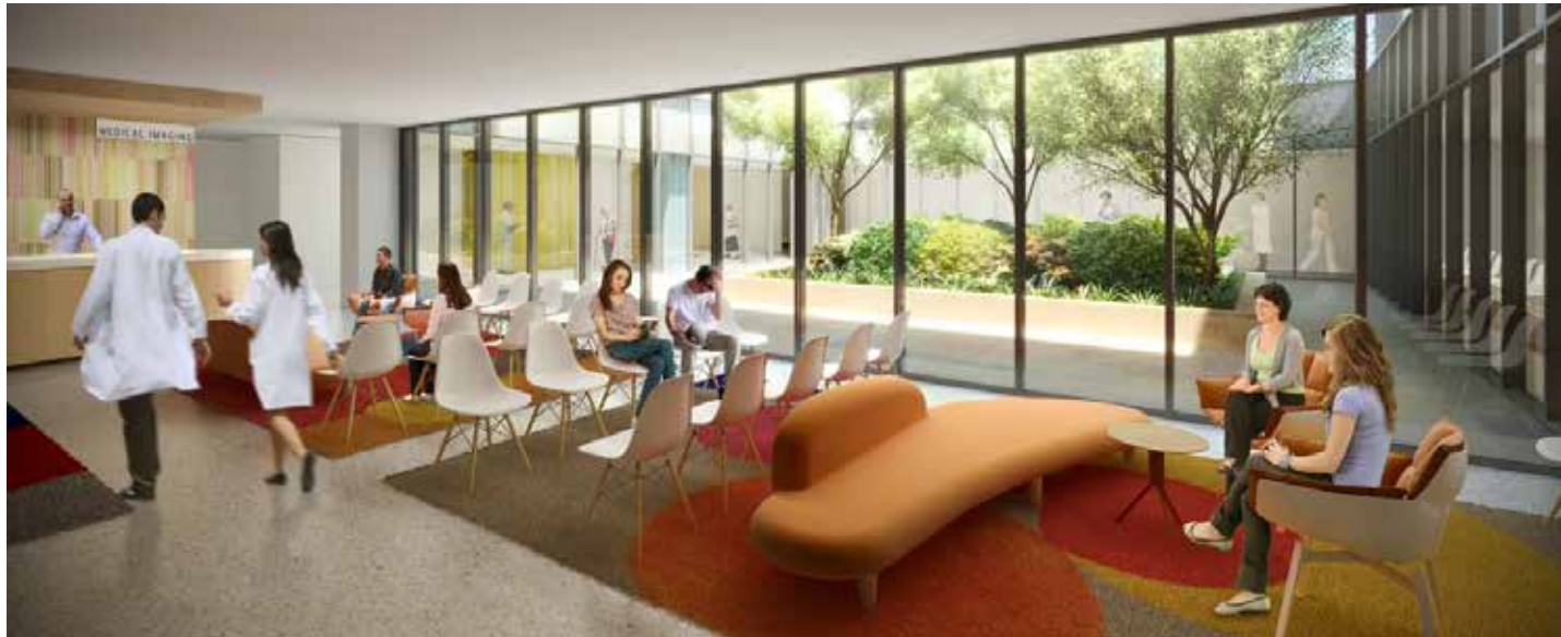
Artist impression of the courtyard views from Northern Beaches Hospital

of services and circulation either side of the main spine, allowing for future growth and change,” Neil said.