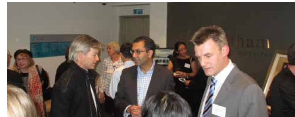
Opening Night of Gallery Exhibition

The exhibited works are expected to be rotated and changed with new pieces every four to six months throughout the hospital.