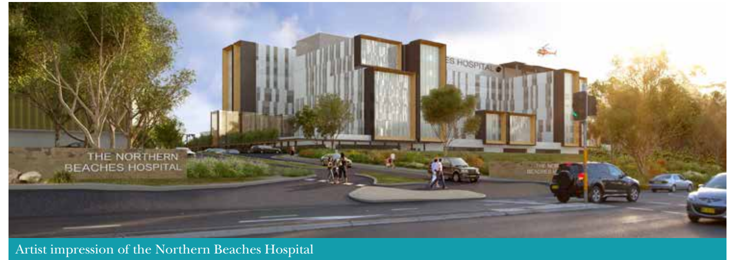
Artist impression of the Northern Beaches Hospital

“The Northern Beaches Hospital will be the first built on a greenfield site in Sydney in 20 years, delivering the best possible care to public and private patients,” said NSW Premier Mike Baird. He also added: