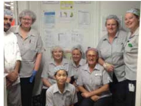
Nepean Private Catering Department Safety Notice Board competition