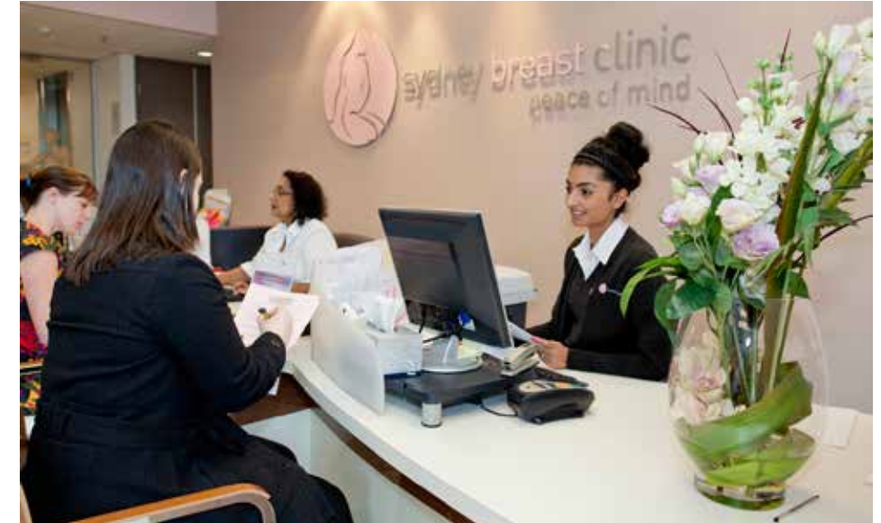
Sydney Breast Clinic (SBC)