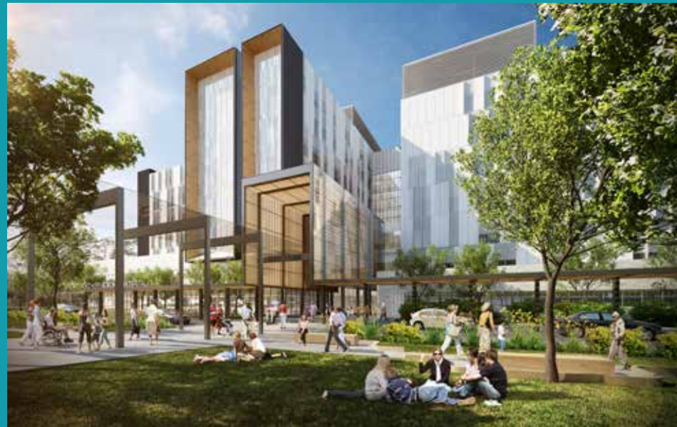
Artist impression of Northern Beaches exterior

The development will provide about 1400 car spaces including a multi-storey car park for more than a thousand cars, plus on-ground parking and drop-off areas.