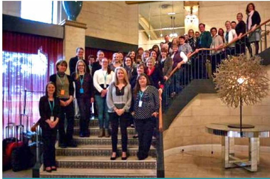
The 2014 Front Office Manager delegates

This responsibility starts with the Front Office Managers and the conference objective was to empower the FOMs with the knowledge and skills to maintain this level of excellence in the workplace.