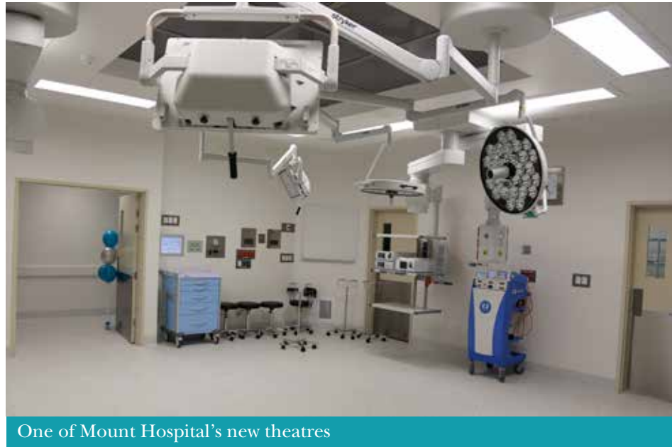
One of Mount Hospital's new theatres

Also under construction will be a relocation and expansion of the Pre-operative Room with patient facilities, creating storage rooms to remove equipment from corridors, constructing additional storage to house sterile instrumentation, prosthetics and loan equipment and multiple dedicated sterile consumable stock rooms. To ensure we improve comfort and enhance the experience for our doctors and staff, a new dining area will be also be constructed.