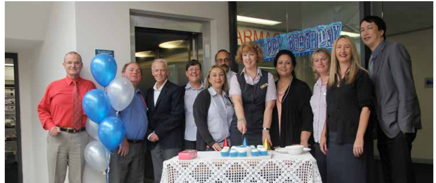
Croydon Family Practice celebrates its first year anniversary