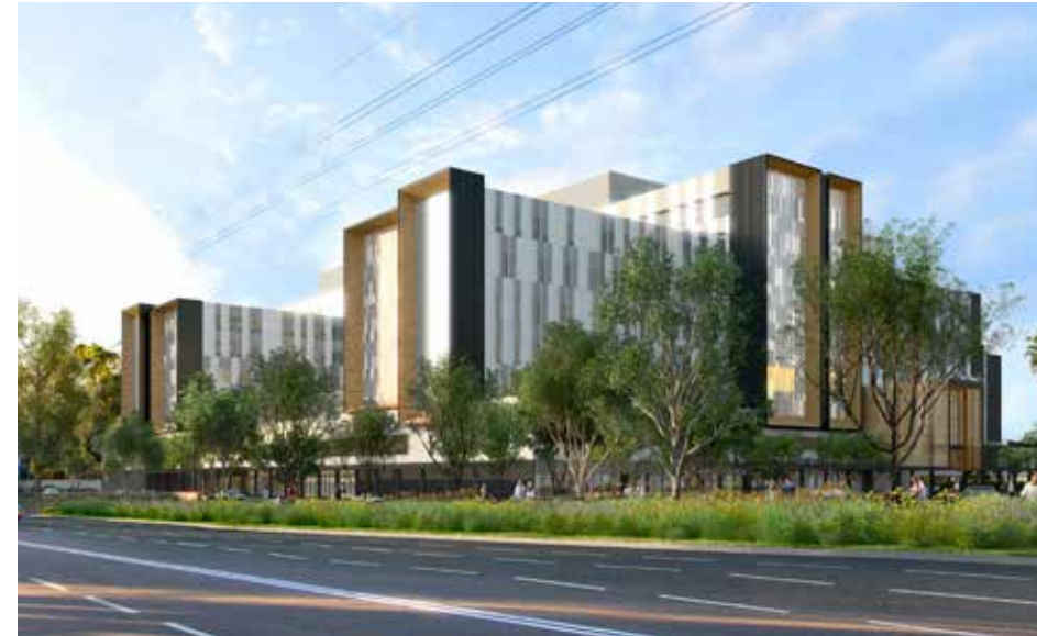
Artist impression of street view

When the new hospital is completed, Manly Hospital is expected to cease operations and NSW Health employees will be offered redeployment in the French’s Forest facility which will employ about 1300 people.