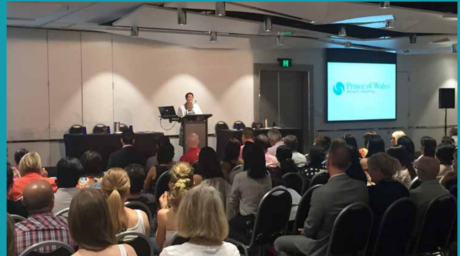
"The Cutting Edge of Neurosurgery" Conference