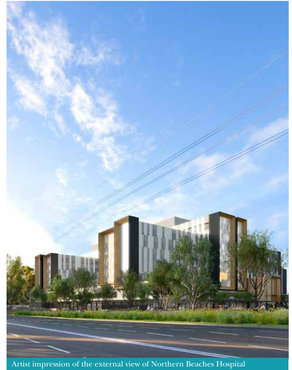
Artist impression of the external view of Northern Beaches Hospital

Email: enquiries@northernbeacheshospital.com.au