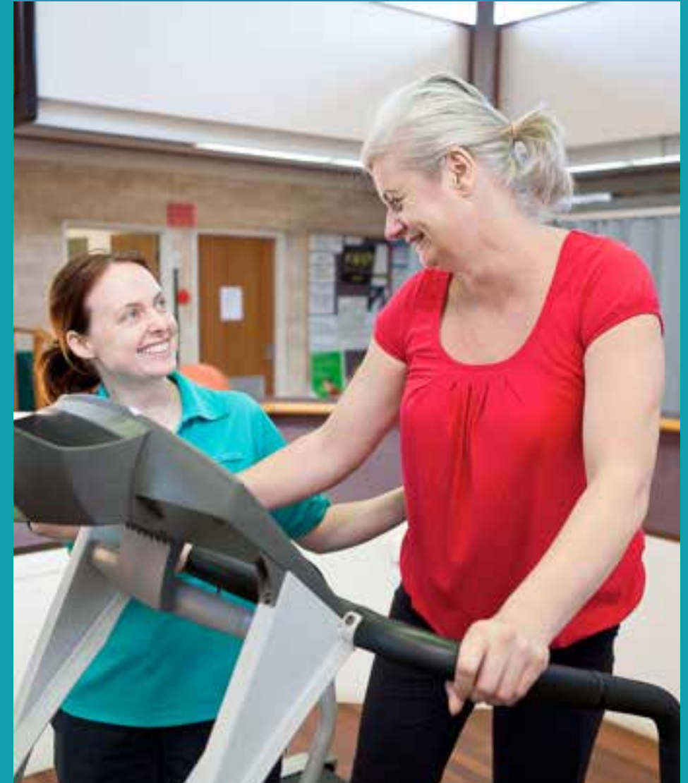
Lady Davidson Private Hospitals' rehabilitation program to improve functional capabilities and quality of life.