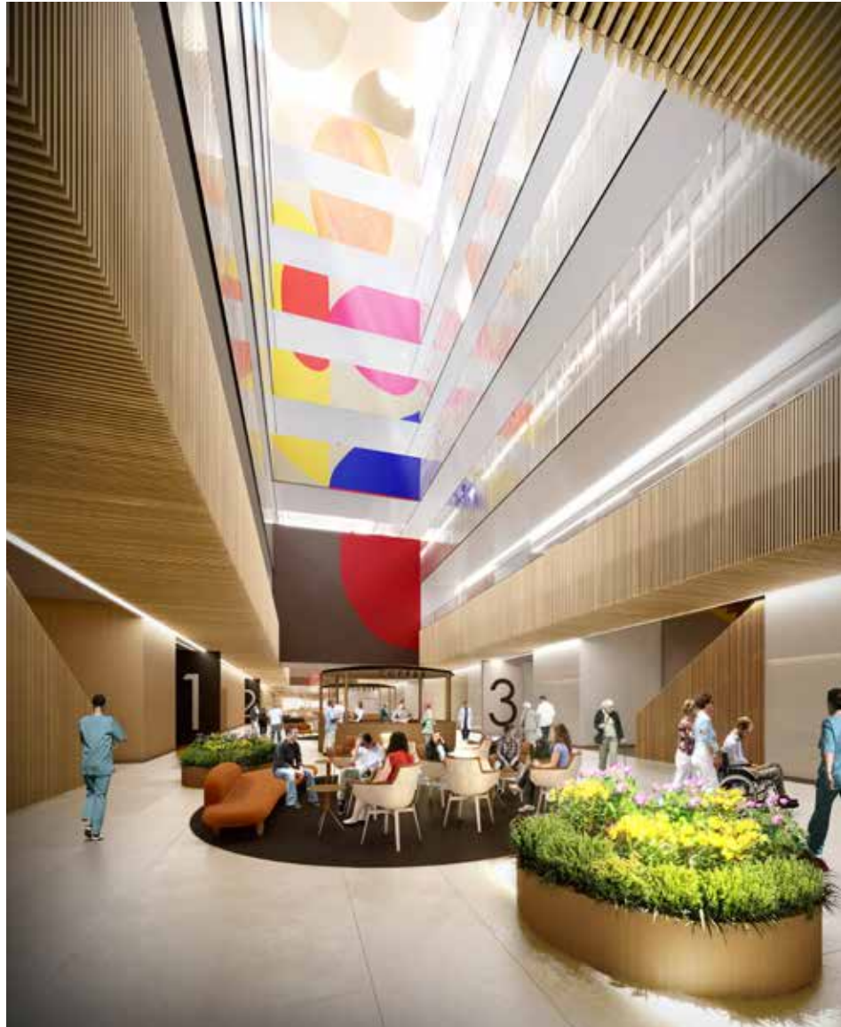
Architectural drawing of lower atrium level